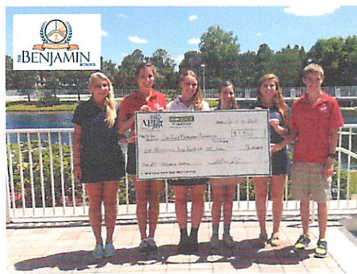
Benjamin School students excitedly present their gift to Sanford-Burnham's Diabetes and Obesity Research Center.